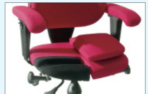
Modified seat and arm upholstery on an Opera 62H model chair